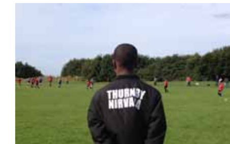
Leicester Nirvana FC 5

Nirvana FC provides an important clear pathway to senior football with our senior team Thurnby Nirvana FC. As a club Nirvana nurtures junior talent from the age of five up all the way to adults. Thurnby Nirvana plays across the midlands and has secured a place on the National league pyramid system and continues to push the boundaries of community football. Semi professional and professional clubs are supportive of these young talented players achievements allowing many the opportunity to play at a higher standard.