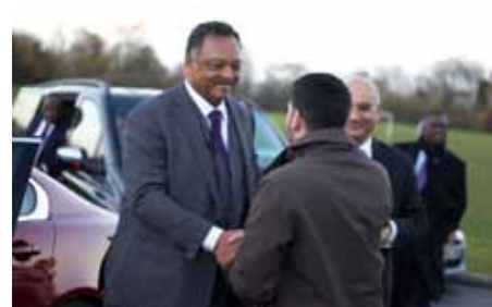
6 Leicester Nirvana FC

The special event took place at Leicester Nirvana FC's home ground in Hamilton amongst honored guests, club members and invited guests.