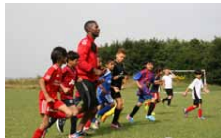
4 Leicester Nirvana FC

Local demand to participate in grassroots football at Nirvana is going from strength to strength and the commitment of those that volunteer is to be commended. Expanding the club with additional teams and members to help meet demand is always challenging. In partnership with the Football Foundation and the 'Grow the Game' initiative, Nirvana has created new teams and is able to provide more training for coaches and volunteers as part of the project.